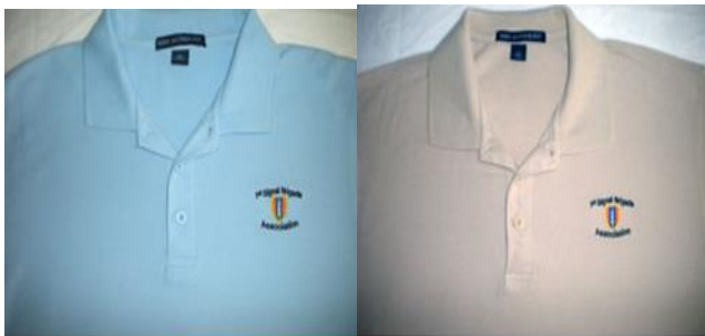
Magnified view of logo