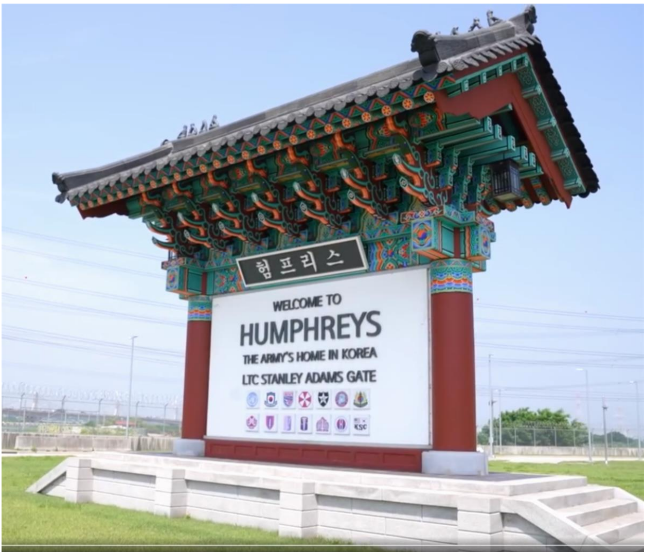
1st Signal Brigade is located at Camp Humphreys