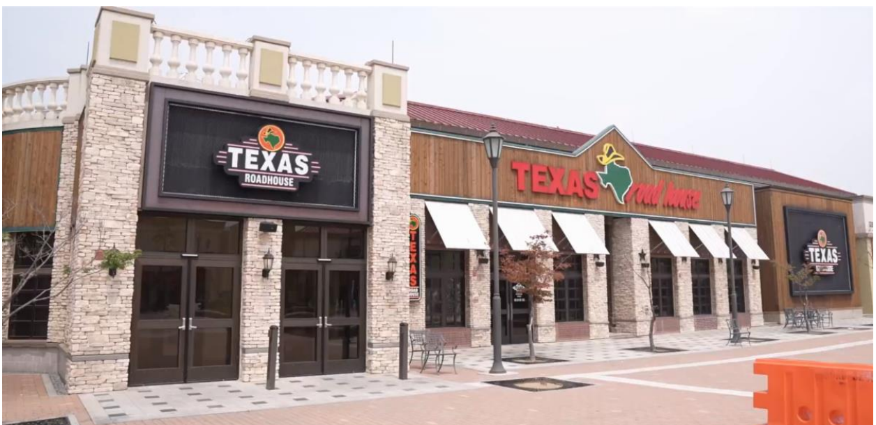
Texas Roadhouse at Camp Humphreys