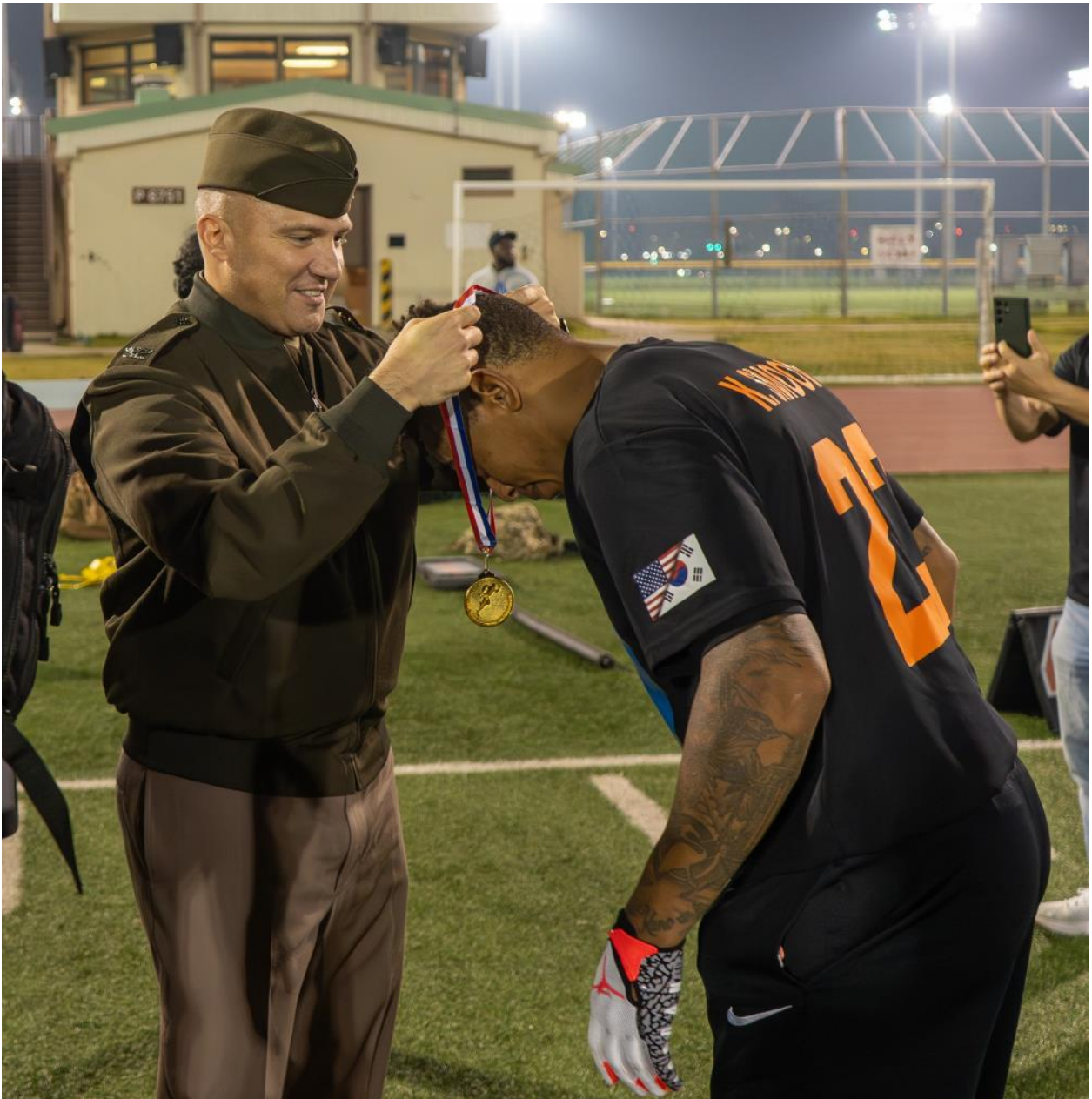
Sports competition encourages higher standards of achievement