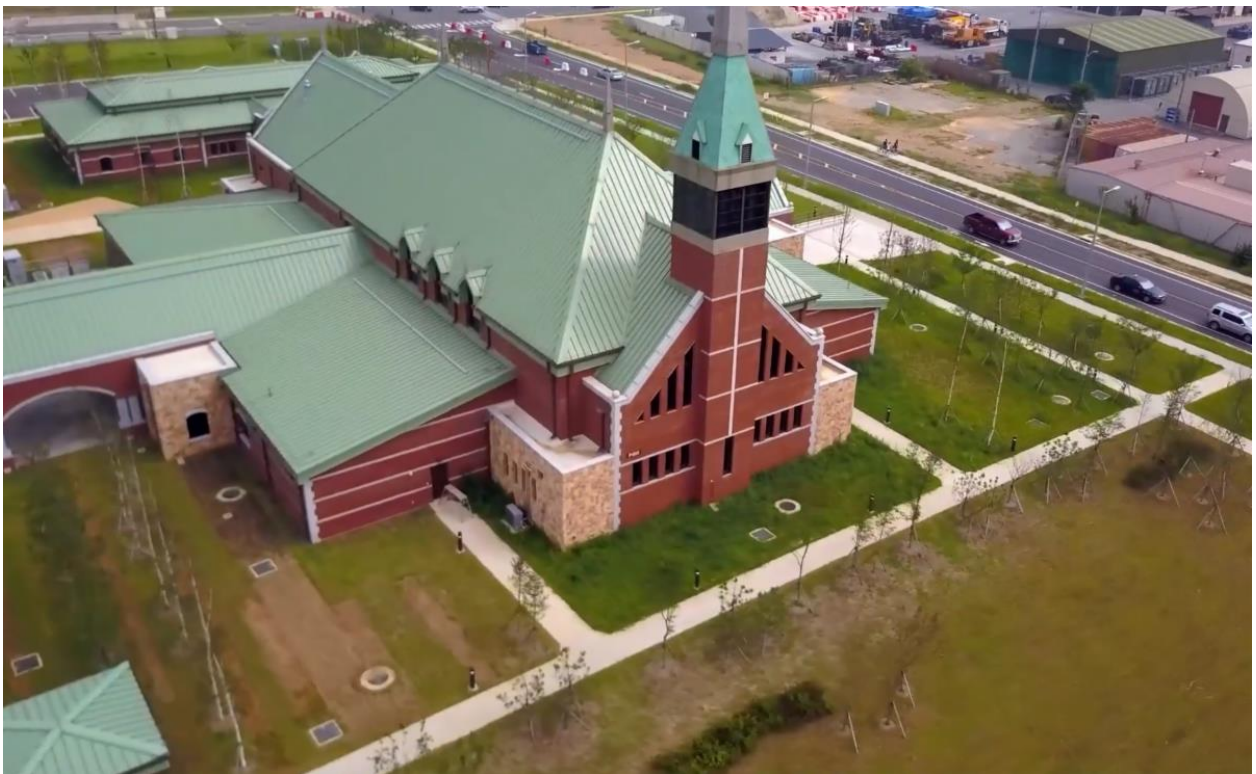
Chapel at Camp Humphreys