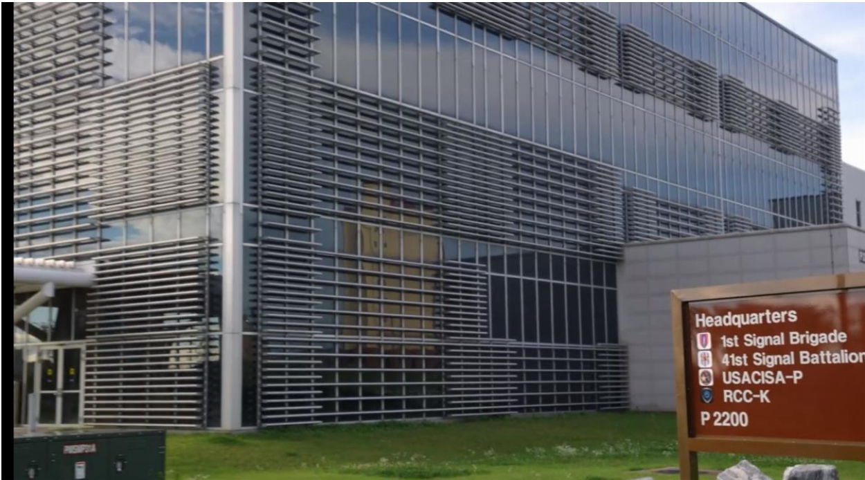
Modern headquarters building for 1st Signal Brigade

Below are some photos showing Camp Humphreys' amenities.