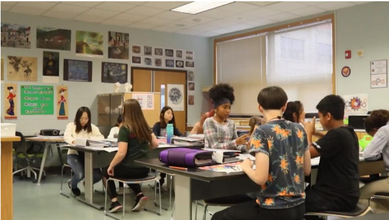
Humphreys High School classroom