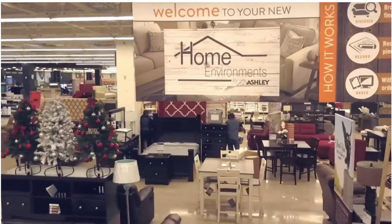
Plenty of retail inventory available